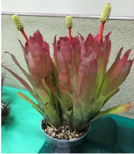
Aechmea roberto seidelii (photo) Aechmea pineliana var. minuta