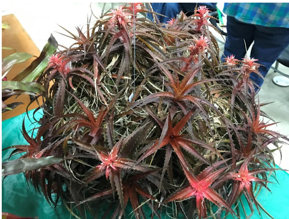
Auctioned: immense basket of Orthophytum 'Copper Penny'